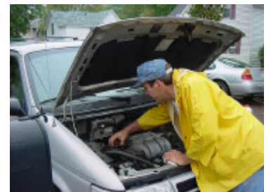
Al Gruba of Xcel Energy changes the oil in a day care van for Bolton Refuge House.